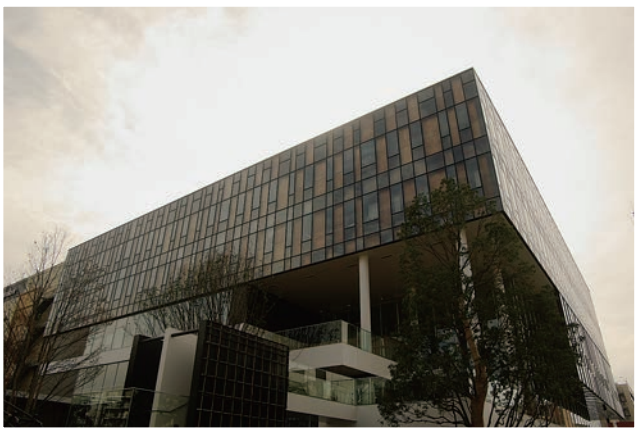
Wooden structural members: laminated lumber and LVL

Eastern Saitama Regional Development Center "Fureai Cube" is a complex facility constructed by a joint project between the Saitama Prefectural Office and the Kasukabe City Office for promotion of industries as well as activities and interaction of local residents. As a cutting-edge model of CO2 reduction, it leads the public facility sector for the future, aiming to be a symbol of attractive community development where people and nature are close together.